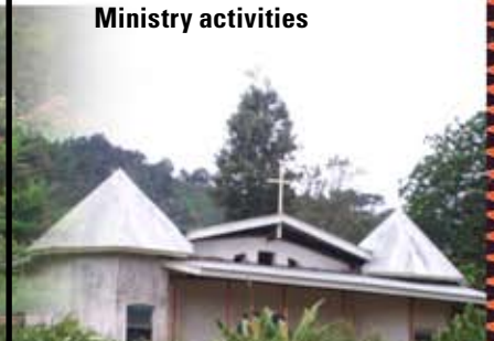
And after remodeling