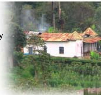
Before remodeling . . .