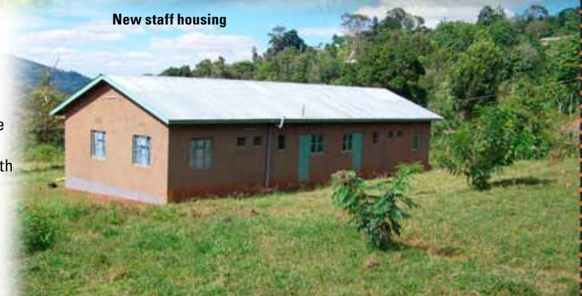
New staff housing