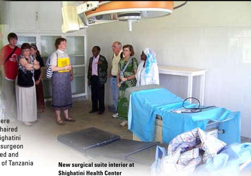
New surgical suite interior at Shighatini Health Center